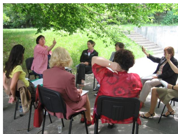
Training of ELLA volunteers in May 2007