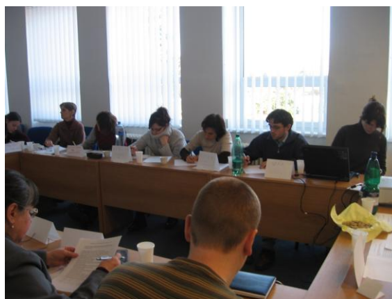
Meeting of Voluntary Organizations, Iuventa, March 2007