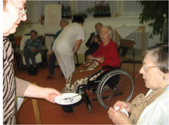
Party for volunteers and clients