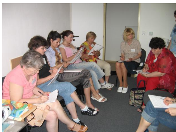
Training of volunteers in May 2007

In 2007 we started to cooperate with the Senior Home Hestia and implemented recruitment of volunteers through the internet and ads in regional ad newspapers. During April and May 2007, ten volunteers replied to these ads and through questionnaire and interview we chose 8 volunteers who were – during two weekends at the end of May trained in above mentioned topics according the international curriculum. We established a cooperation with six lecturers working with seniors, sick and dying people and also provided our volunteers with regular group supervision of a psychologist. These common meetings are devoted to volunteers who can meet, share their experience with accompanying. They can even give some advice to each other on how to deal in difficult situations and to encourage each other in further visits.