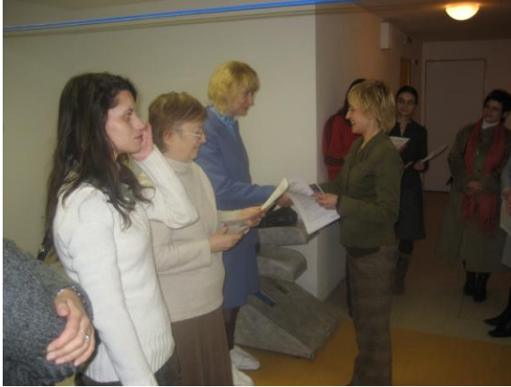
ELLA Certification Ceremony The International Day of Volunteers

them, and we are just sitting there, me caressing her hands. After some period of silence I talk to her about weather, we look through calendar, comment on Christmas or other decoration, etc. In the summer, we used to sit at the terrace and once we also visited the garden of the senior home. We tried to draw, read magazines, but she was not interested in it.“