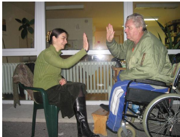
Volunteer with a client